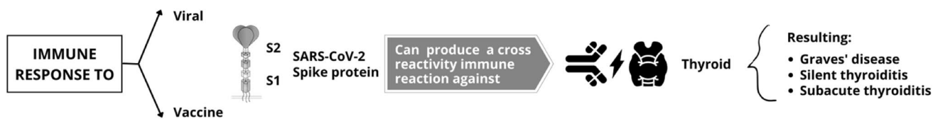
Fig. 3 The natural or acquired immune response against protein S of SARS-CoV2 due to the structural similarity with some human antigens can generate a cross reactivity immune reaction against the thyroid gland

In addition, in 2021, Vodjani et al. demonstrated cross-reactivity to human antigens of antibodies against protein S and the nucleocapsid of SARS-CoV2 [27] (Fig. 3). This would explain, at least in part, some of the autoimmune/inflammatory reactions produced during SARS-CoV2 infection and also by the vaccine. Thus it is possible that proteins generated due to the vaccine cross-react with thyroid target proteins due to the molecular mimicry triggering autoimmunity together with an inflammatory reaction in genetically predisposed individuals [20, 27]. These phenomena could be enhanced by adjuvants in the context of post-vaccination ASIA. The observation that most cases occur few days after vaccination, in a time when viral proteins reach its peak would support this hypothesis [14–16, 20].