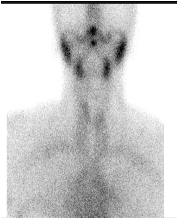
Fig. 2 Thyroid scintigraphy of case 1 with very low uptake of the thyroid gland compatible with subacute thyroiditis

mL ( <0.7 UI/mL). Thyroid scintigraphy concluded a hyperfunctioning diffuse goitre compatible with Graves' disease. A thyroid ultrasound showed a diffuse decrease in echogenicity with some echogenic septum and increased vascularity. Methimazole was started.